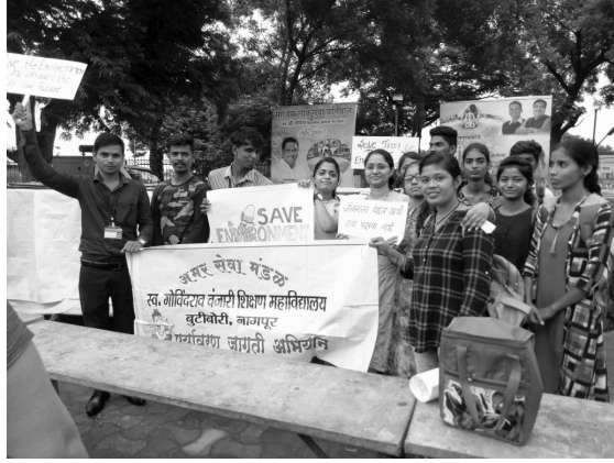
Awareness of Water Pollution

Late Shree GovindraoWanjari College of Education always tries to develop effective communication in students through several activities. Our college organized various out reach activities e.g. Skit, Street Play, NirmalyaSankalan& Awareness of Water Pollution, Bhasha Divas etc.