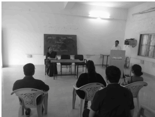
Guest Lecture on Public Speaking

Some of the workshops organized by the college are as below.