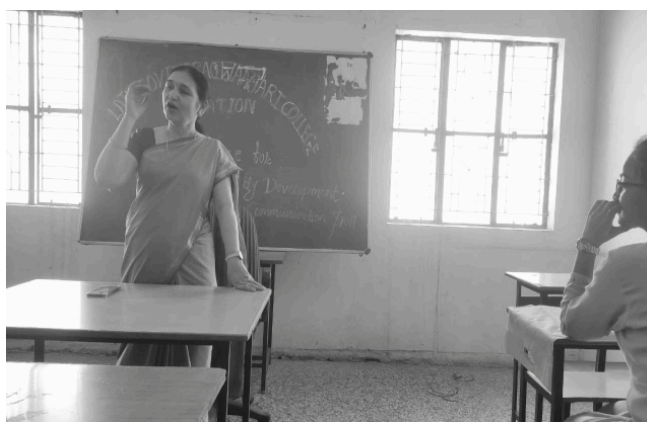
Workshop on Communication Skill