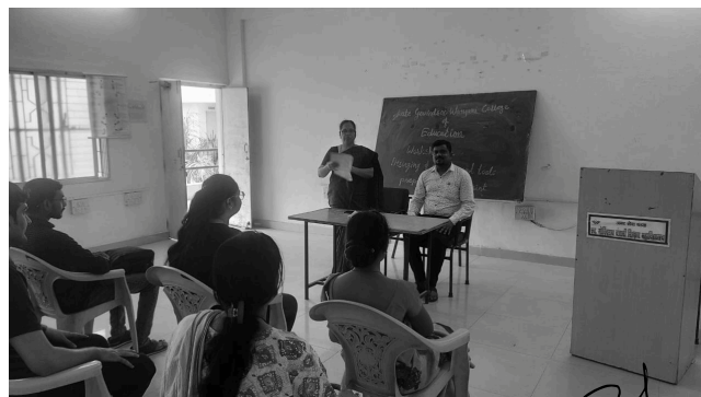
Workshop on Achievement Test

Assessing students is an important part of teaching-learning process. To teach he trainee how to assess the students performance, the college conducted workshops and asks to practical work to prepare an achievement test i.e. unit test and also taught how to create blue print and prepare unit test. Teachers act as a guide ad supervisor.