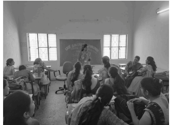
Discussion on Formulation of Teaching Objectives