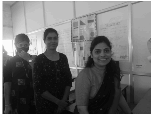
Exhibition of Models and Charts