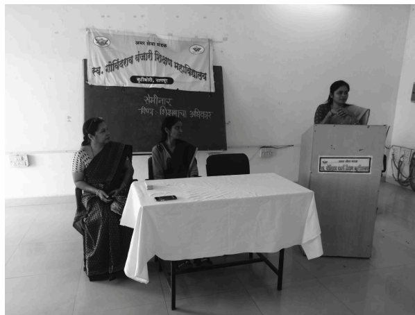
Seminar on Inclusive Education

To understand different aspects of community, the college organizes visit to different community services institutions like orphanage, old age homes, differently able schools. These visits helps to develop empathy among students and they get experience of using local environmental in teaching learning process. They are also asked while teaching use multilingual teaching.