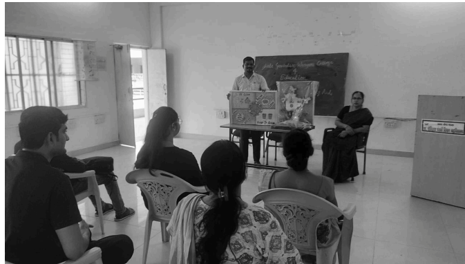
Workshop on Low cost Teaching Aids

Every B.Ed. trainee needs to know how to prepare lesson plans. To develop teaching skill college ask students to prepare micro teaching lesson plans, simulated lesson plans and practice teaching lesson plans in each teaching subject. During this activity teacher tries their best that every student attain most of the objectives and learn importance of professionalism in preparation of lesson plans.