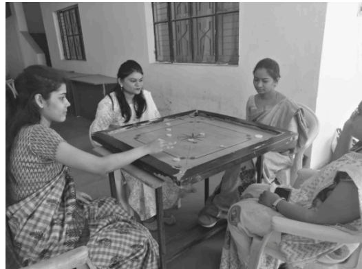
In Door Sports Activities