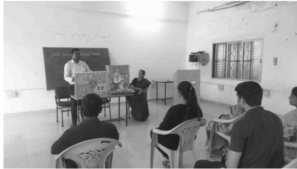
Workshop on Making of Low Cost Teaching Aids

Teacher use variety of print and non-print media to bring innovation in their teaching learning process. Individual differences are taken care of while choosing any teaching-learning material e.g. Teaching aids. Faculty always tries to train their students to use multiple modes while learning. Use of models, power point presentation sharing YouTube Videos, sharing e-contents in classroom which help to develop confidence among both teachers and students.